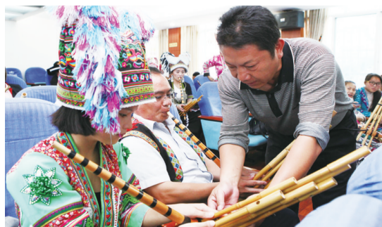
◀Lauxsae son bouxhag baenzlawz gaem aenvenz.