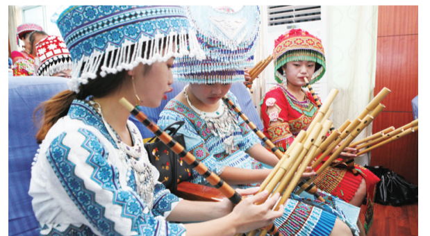
► Bouxhag doxbang doxbag boq aenvenz.