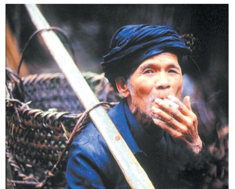
▲ Goenglaux mbouj dwen naiq, daiq vunzlai nauh ciet.