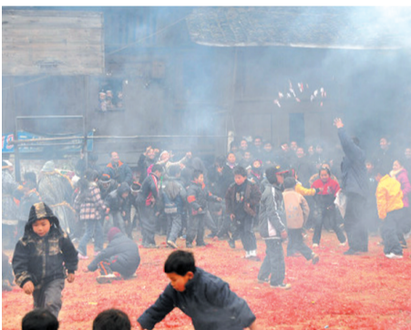
▲ Vanq dangzbingj dem angq, vunz doxcanj gip aeu.