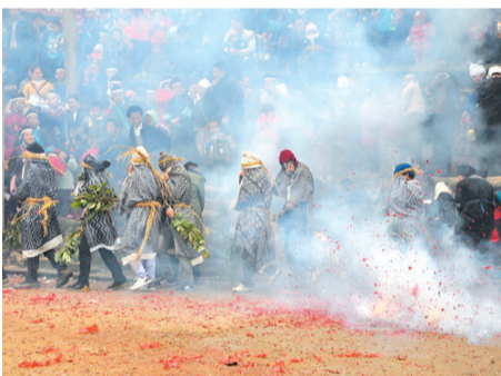
▲ Doxgiet caeg couh lau, bauj mbanjranz bingzan.