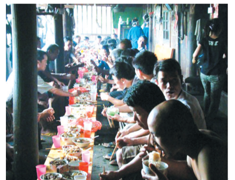
▲ Ngaizbakranz hoenghnauh, lauxnyaeq caemhdaiz gwn.