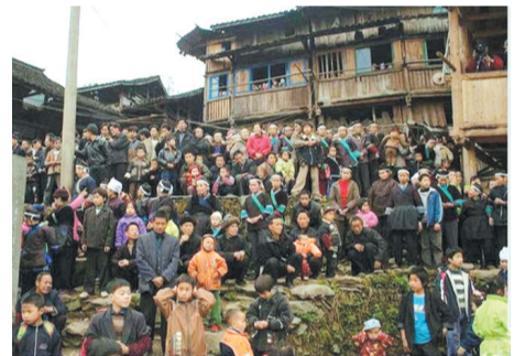
▲ Vunzmbanj comz diegdangz, caezgya angq gvaq ciet.

Bouxcaeg deng “gyaep” deuz le, youq rog mbanj “caeg” di byaekheu ndeu banfuemx dauqma yiengq gyoengq vunzmbanj nyinh-coih. Doengxhaemh, moix ranz dawz vanj haeuxnaengj ndeu caeuз gaen laeujhaeux ndeu daeuз, comz youq diegdangz naj laeuzgyong gwn ngaizbakranz, daengx mbanj doxhuz angqyangz.