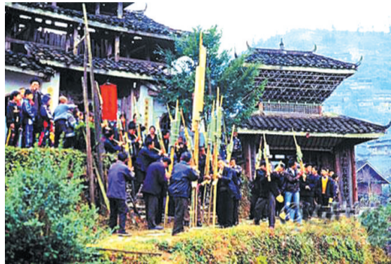
▲ Luzswnggh boq hwnjdaeu, vunzraeuz caen sim' angq.