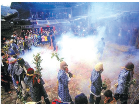
▲ “Gyoengq caeg” hopngomx byaij, baij yiengh souh saemj-buenq.

Moix bi ndwencieng coit, Sanhgyangh Dungcuз Swciyen Duzdung Yangh Dangzcauz Dungcai daengxgyoengq vunzmbanj cungj comz youq diegbingz naj laeuzgyong, angq gvaq aen ciet gyaep sez conzdungj daegbied ndeu—“ciet gyaep caeg” hozdung, maqmuengh daengx mbanj bibi bingzan. “Ciet gyaep caeg” dwg ngoenzciet conzdungj Dangzcauz Dungcai gag miz, bi 1925 gvaqdaeu moix bi ndwencieng coit itdingh aeu banh baenz ngoenzciet hozdung ndeu. Dieg mbanj Dangzcauz bya sang faex ndaet, ciengzseiz miz bouxcaeg dwk haeuj mbanj, miz bi ndeu ndwencieng coit, bouxcaeg rox ngoenzneix vunzmbanj itdingh gaj mou gvaq cieng, miz noh gwn miz laeuj dep, couh youq ngoenzneix haeuj mbanj ciengjdued, ndaw mbanj boux singq Lungz ndeu daiq vunzmbanj buek hoenx gyaep gyoengq caeg deuz. Gvaqlaeng, vihliux gyaep sez, caemh vihliux son'gyauq daihlaeng mbouj ndaej guh gij saeh haih vunz haenx, couh dingh youq ndwencieng coit banh aen hozdung “gyaep caeg”, maqmuengh bibi ndaej bingzan.